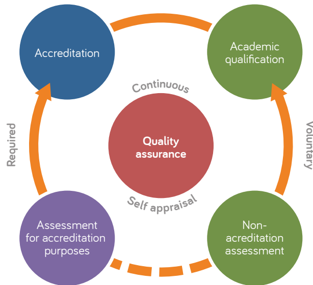
Figure 1. Quality assurance diagram.

managed from all hierarchical levels and based on the 4 concepts established in the figure 1, for the achievement of quality assurance.